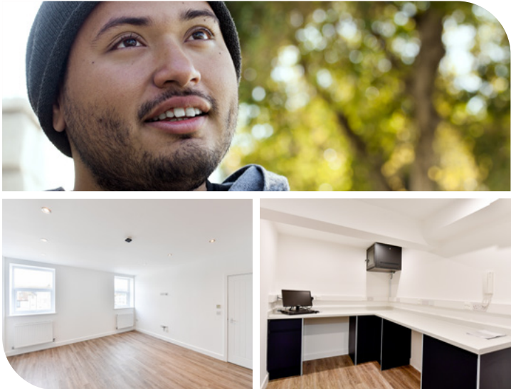
CYG-1526 | Date of Preparation: 27/05/25

Please visit cygnetgroup.com for more info | Follow us on social media: