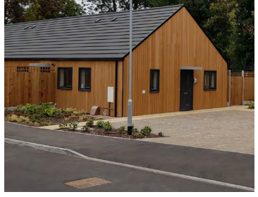
CYG-1600 | Date of Preparation: 16/10/24

Please visit cygnetgroup.com for more info | Follow us on social media: