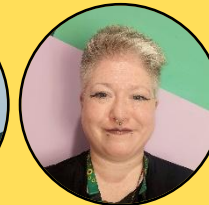
HEL Maths Teacher