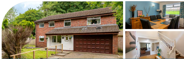
1 Vincent Court, Blackburn, North West Community Residential Service