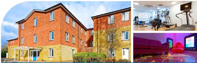
Bridge Hampton – Cygnets Bury Dunes, Lancashire Low Secure Service